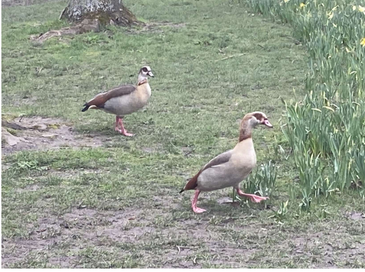
Photo: Egyptian Geese in Cherry Hinton Hall

Water birds such as mallard and moorhen are now forming pairs and our resident swans fly between the pits and the pond in Cherry Hinton Hall deciding where to nest (last year they successfully reared 6 of their 7 cygnets from a nest in the pits). A pair of Egyptian Geese is also often seen strutting about by the Hall pond so maybe they will raise a brood this year. Originally escapees from private collections (they are native of South Sahara and the Nile Valley and were considered sacred by the Ancient Egyptians) there are now many feral populations in the UK, although these are the first to be seen near the Brook.