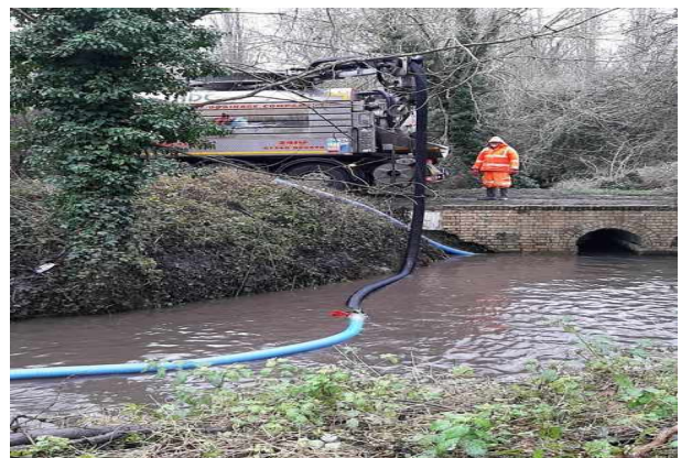
Photos: Pipe used for drawing up the silty water (left); machine that separates silt from water.